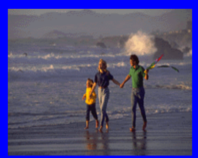
"Our hearts are restless, O Lord, until they rest in you."

How do you recognize the movement of the spirit in your heart? The Catholic faith calls the process "discernment." It's your decision, but you owe it to yourself to get honest and truthful information so you get it right.